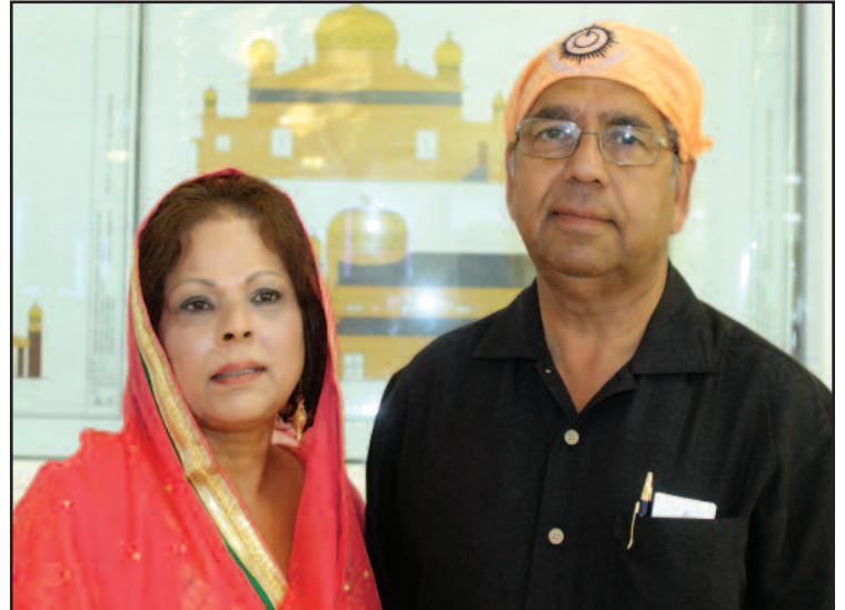
First Advertisement & News about the opening of Shri Guru Ravidass Temple Pittsburg (California)