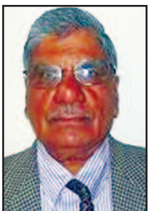
Founding Member, Shri Guru Ravidass Temple, Pittsburg (California)